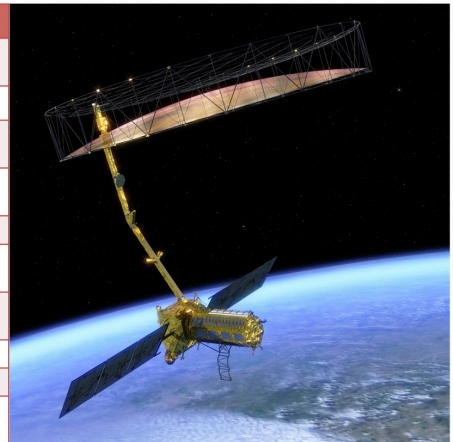
Figure 1 – NISAR characteristics and capabilities.

NISAR’s L-band radar instrument will provide all-weather, day/night imaging of nearly the entire land and ice masses of the Earth repeated 4-6 times per month, and the S-band instrument will provide additional coverage of India and parts of the polar regions. NISAR’s orbiting radars can image at resolutions of 3-50 meters, depending upon the operating mode, to identify and track subtle movement of the Earth’s land and its sea ice, and even provide information about what is happening below the surface in areas where subsurface processes result in surface deformation. Regularly and consistently repeated images can be used to detect small-scale changes before they are visible to the eye and to track dynamic changes as conditions evolve.