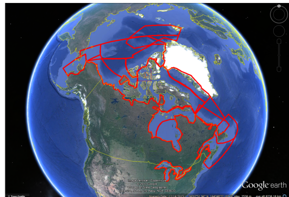
Figure 3 Radarsat Constellation Mission coverage areas.

In addition, the sea ice motion measurements from NISAR aid in sea ice modeling and forecasting.